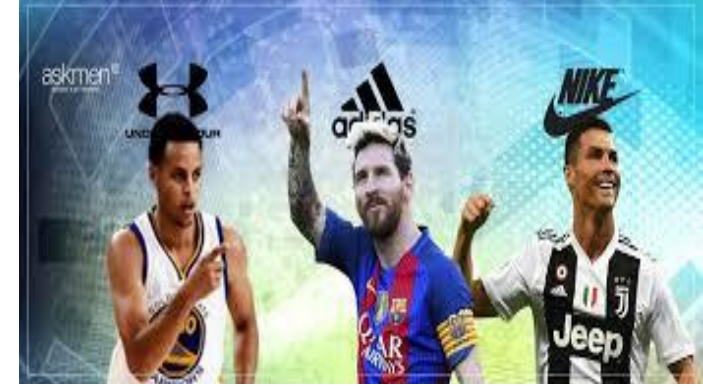
The golden triangle