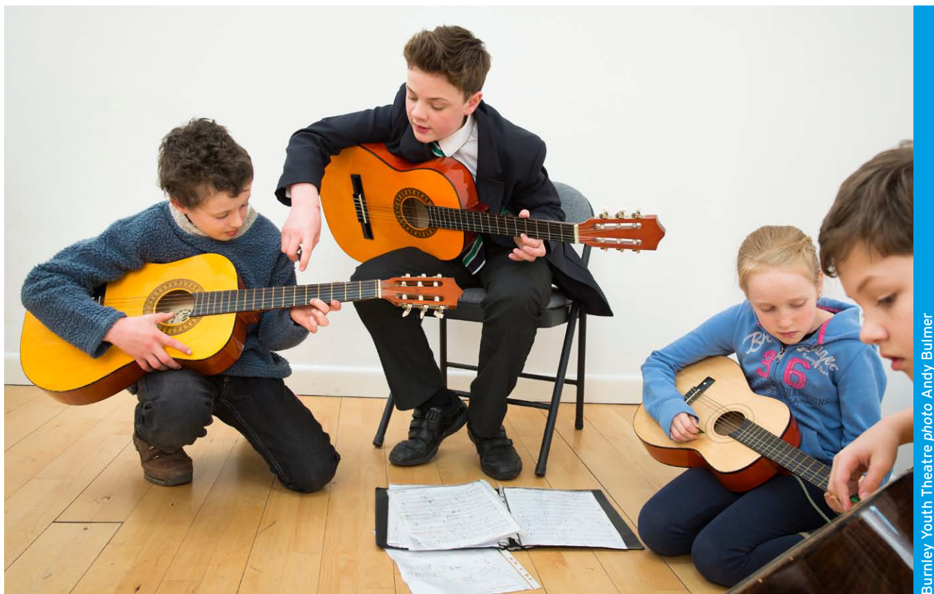
Burnley Youth Theatre